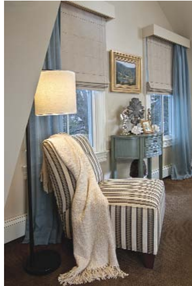
By using creative space planning, Bresin was able to change two second-floor bedrooms into three bedrooms and a sitting area, all of which are accessed by the main staircase in the original part of the house. Sea horses, a favorite of the wife, add playful touches in the guest area. Matching nightstands, mirrors and swing lamps anchor the bed in the guestroom, which offers two armless chairs as perfect places for relaxing.

in Upper Montclair. Bresin had successfully guided them through major renovations in 1995 that included a new kitchen. This time there were only a few caveats. The couple loved their kitchen and wanted to retain the look, and it was important to the wife that the new sinks and commercial range be white.